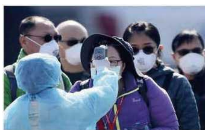
High Volume of Management